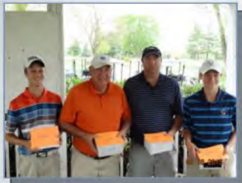
First Place—Score 55

The 19th Annual Ben Alexander Golf Scramble "The Big Ben" was a success in that we had twice the amount of teams as last year participate. The proceeds are being utilized to recondition the gymnasium floor, purchase additional workout equipment and to purchase two bicycles for Church Members to be able to sign out and use.