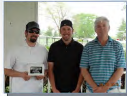
Third Place—Score 58